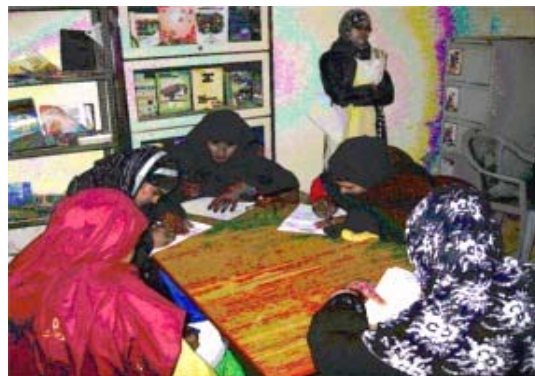
One day orientation of selected CCAs

The final procedure of the selection was the interview process.